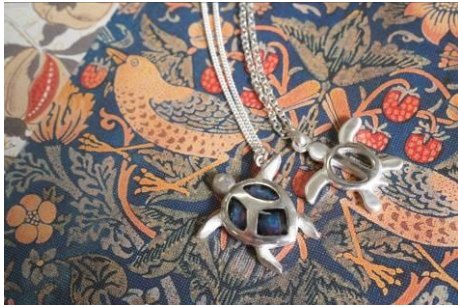
Completed piece (Left)