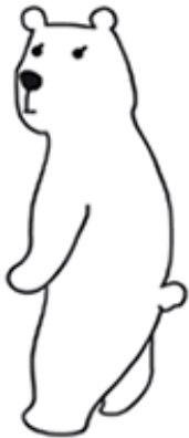
Pattern sheet (Actual size)